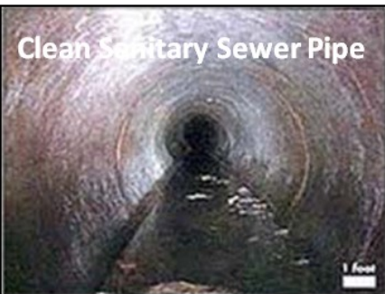
Clean Sanitary Sewer Pipe

Excessive accumulation will restrict the flow of wastewater and can result in a sanitary sewer overflow.