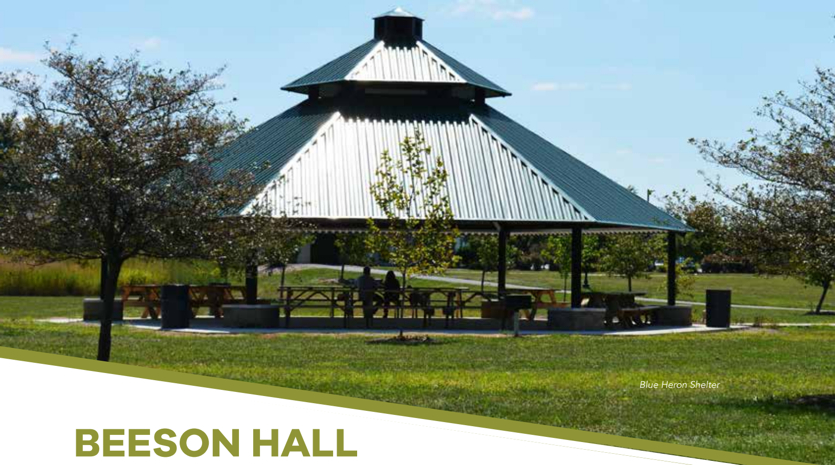
Blue Heron Shelter