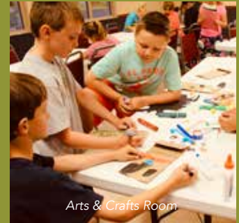
Arts & Crafts Room