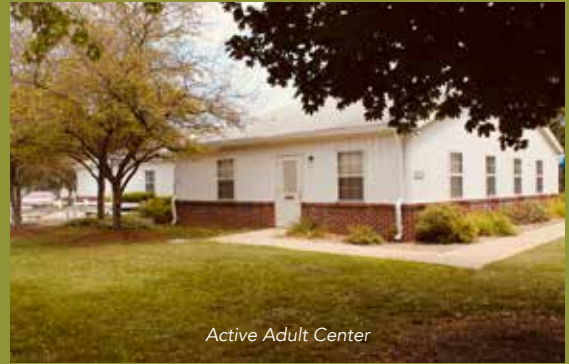
Active Adult Center

The Activity Room on the west side of the Active Adult Center, located at 160 East Adams Street, is available for baby showers, reunions, anniversary parties, or any other special events. This rental space accommodates approximately 70 people and includes tables, chairs, two bathrooms, and a full kitchen containing a stove, oven, microwave, refrigerator, ice maker, and serving window. Also included is a patio with seating for 16+ people. Rental times: 10am-10pm. Please pick up a key to the Active Adult Center at the Recreation Center before your event. $125/DAY + TAX