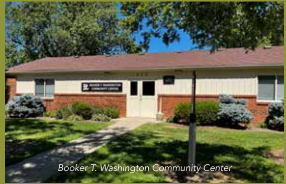
Booker T. Washington Community Center

Great for reunions, receptions, showers, parties, and meetings, this facility offers seating for 80 people. Amenities include: kitchen, restrooms, serving area, and outdoor playground. Rental times: 10am-10pm. Please pick up a key to the Booker T. Washington Community Center at the Recreation Center before your event. $100/DAY + TAX