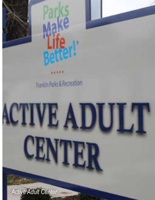
Active Adult Center

Conveniently located on the southeast side of Franklin, it is easily accessible to downtown and surrounding Franklin churches. Contact Jamie Beck for more information at jbeck@franklin.in.gov or (317) 736-3689.