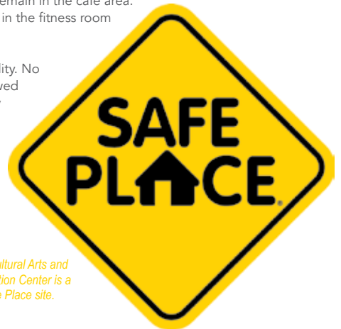
The Cultural Arts and Recreation Center is a Safe Place site.